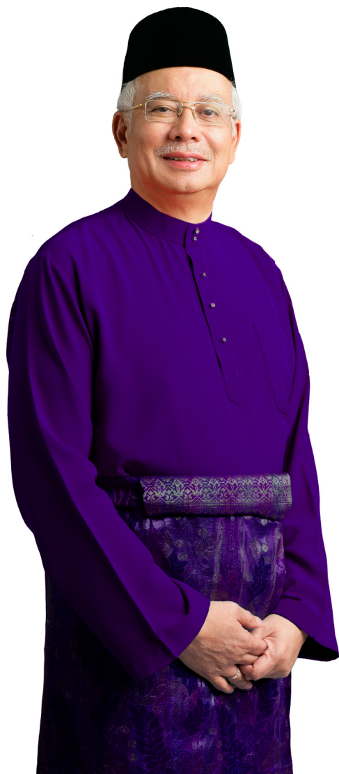
YAB Dato' Sri Mohd Najib Tun Haji Abdul Razak Prime Minister and Minister of Finance Malaysia