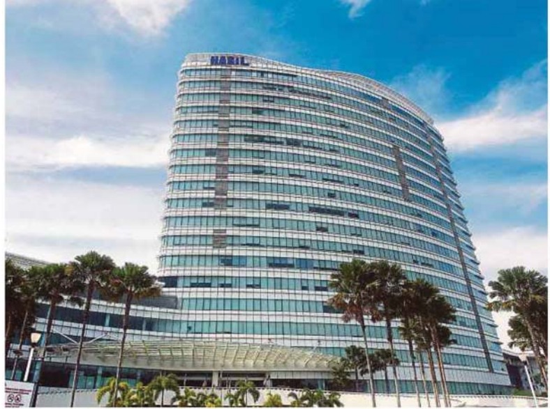
The Inland Revenue Board headquarters in Cyberjaya. FILE PIX