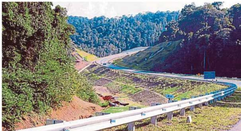
Roads don't pay for themselves. Taxpayers' money is used to build the infrastructure of the country.

Having tax arrears could affect one's plans to go on holiday abroad when they are prevented from leaving the country by the Immigration Department.