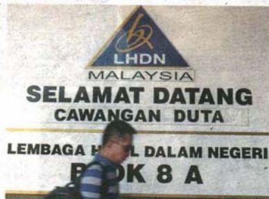
(Above) There's more than one way to pay your taxes.

You can, however, pay your tax arrears (if any) by Dec 30 this year through IRBM's